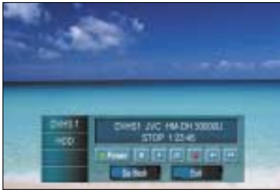
D-VHS Recording Menu