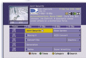
Advanced Program Guide™

Caller ID subscribers, see who's calling with an on-screen display